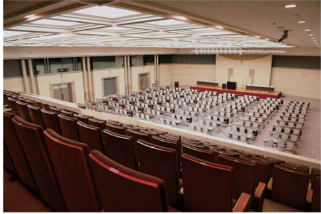
Exterior and interior views and the layouts of the conference sites